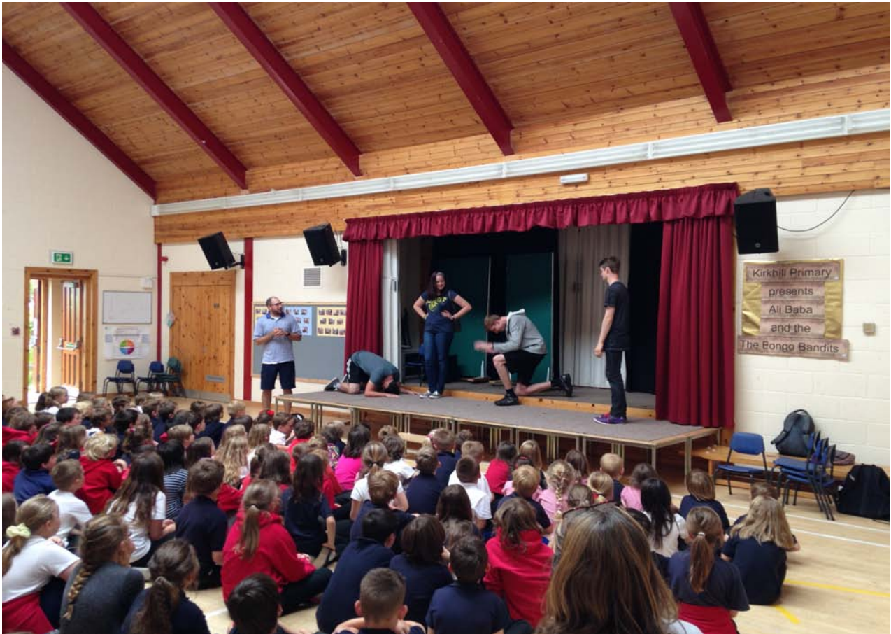
The YWAM team acting out the story of Daniel at Kirkhill PS

I am also so thankful for our amazing back up team who have provided meals and accommodation for the YWAMers and made them feel greatly welcomed. Well done all! You have played just as important a part in this mission as the team on the "front-line." Our Elder led services on Sunday 5 th were also another terrific example of the people of God using the gifts of God. In this case to lead worship, share His Word and connect with His heart for the lost and suffering - specifically those many millions who live under the scourge of HIV/AIDS. Again I would like to thank all those involved in the planning and delivery of these two services.